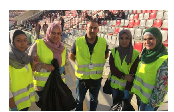
Al Nathafa Thaqafa Initiative during FIFA Women's U17 World Cup at Al Qweismeh