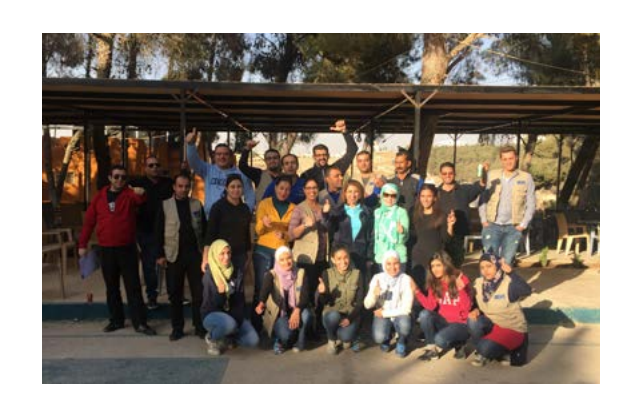
RHAS team retreat on leadership skills at Challenger Village