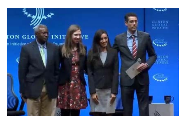
RHAS Participation in Clinton Global Initiative presenting the HCC program