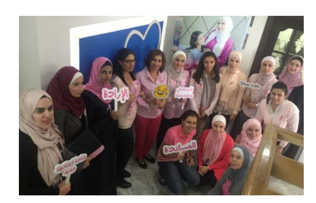
RHAS activities on Breast Cancer Awareness Day