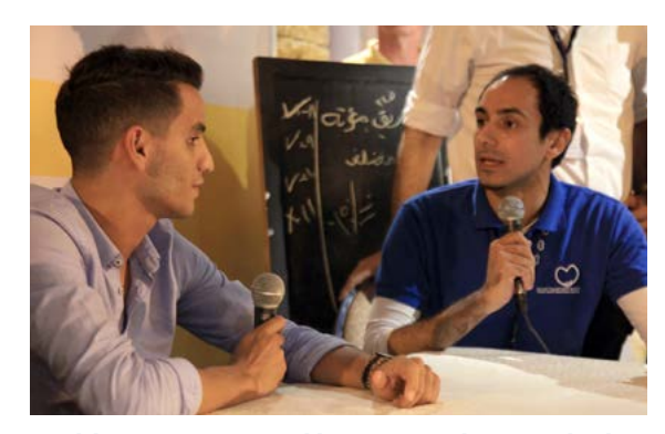
Health Corner managed by RHAS at the New Think Festival 2016